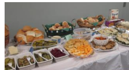
Lots of good food, Christmas cheer and fast paced Quilt Bingo at our December meeting!