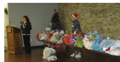
See page 4 for the Salvation Army Christmas update

It's time for New Year's quilting resolutions. Bring an extra $2 to sign up for resolutions this year and don't forget to bring in any finished projects that were on your list last year. The draw for the prize pot will be at January's meeting. See page 2 for more info